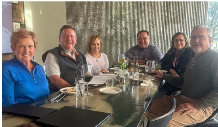
Many Weighty Topics Were Discussed at Happy Hour