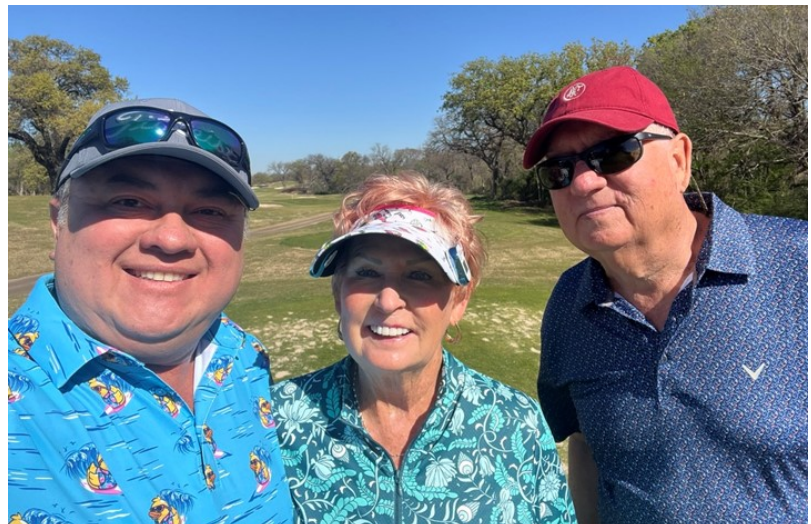
Team 1 at Bear Creek