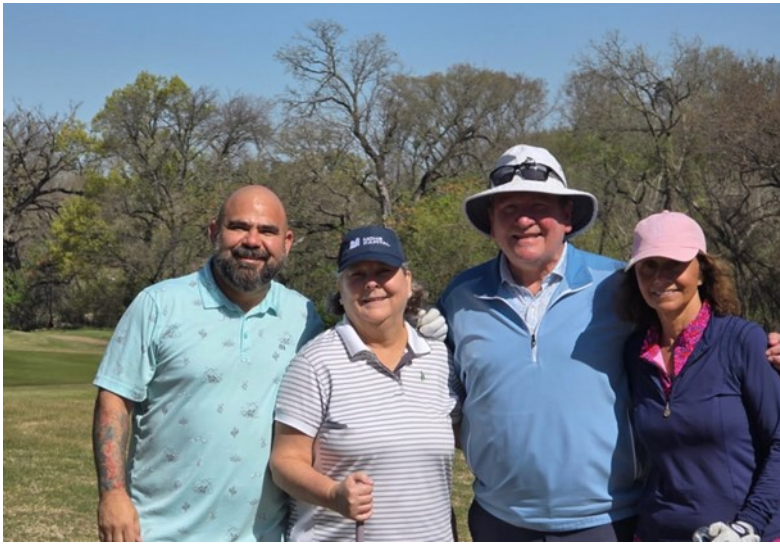
Team 2 at Bear Creek