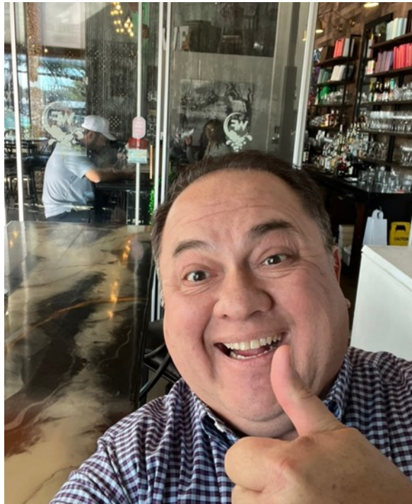
Wine Fusion Gets a Thumb's Up