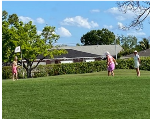
San Carlos Park, March 14 th