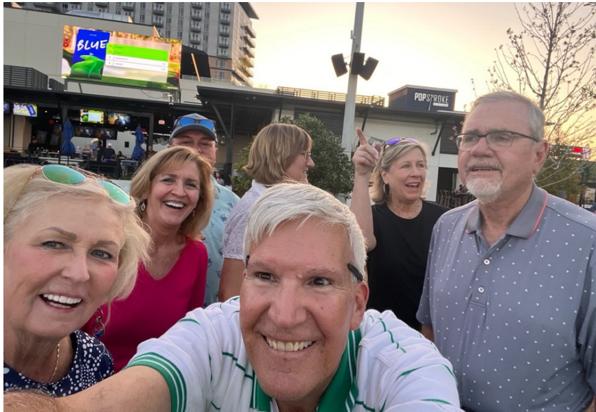
Turns Out We're Not Great at Miniature Golf Either