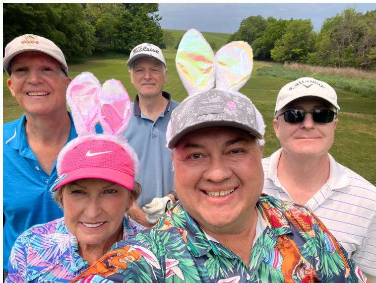
An Easter-Themed Grapevine Outing