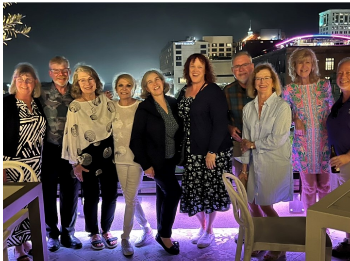
Savannah at Night