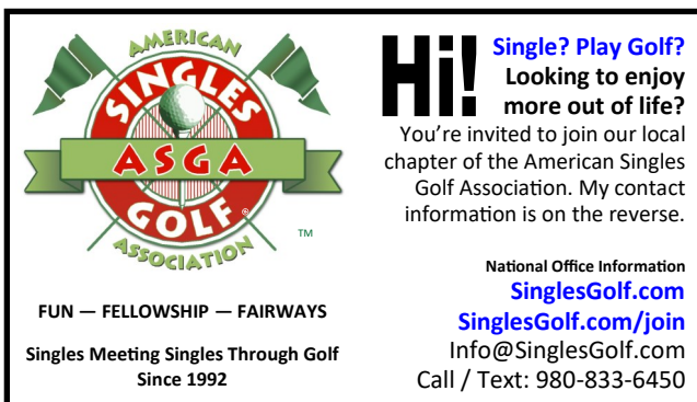
Front side of business card

25 Business Cards Will Be Mailed to You Upon Request!