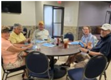
A good time with friends

A small group went to Casa Lupo pizzeria for some food, drinks, conversation and laughs after the round, which ended the Event beautifully.