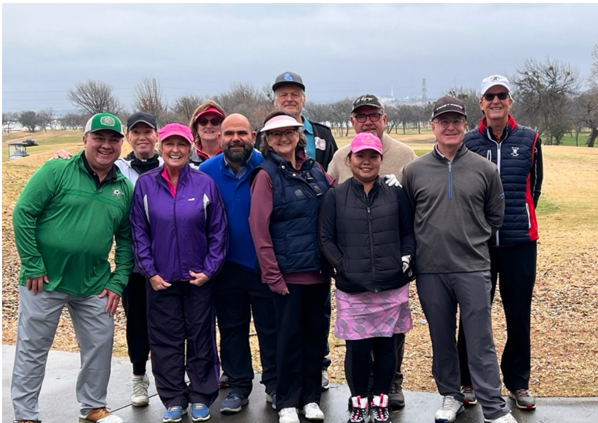
A Decent Turnout for February Golf at Prairie Lakes