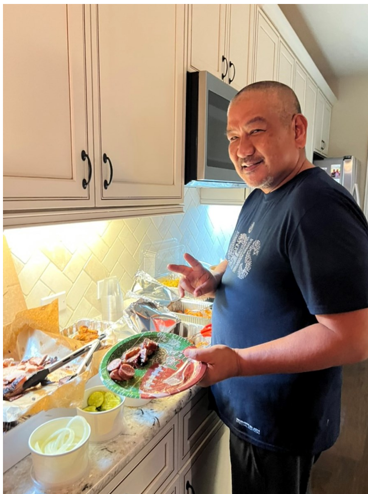
Gotta Get Some Goodies