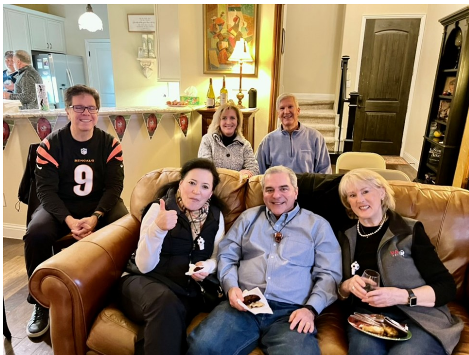
Super Bowl Party at Brant's Place