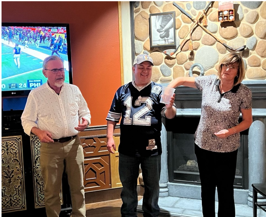
The Wine Raffle was Intoxicating