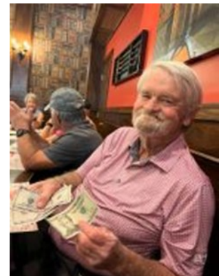
Craig never Wins