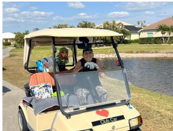
Our fearless leader for the day and CTP winner for the women