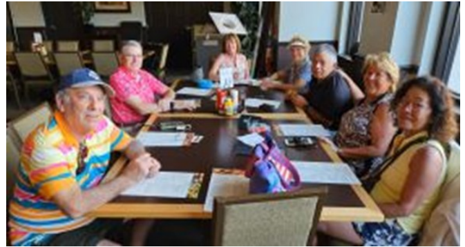
a bunch of troopers