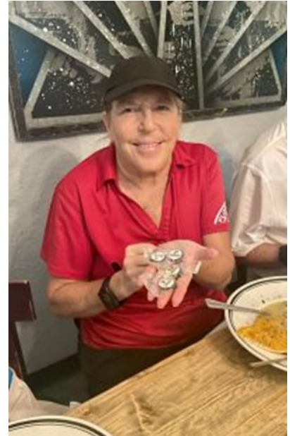
Capt of the Winners